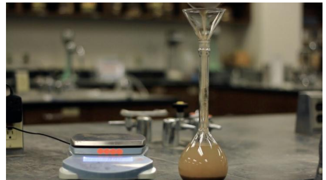
Figure 3: Determination of specific gravity using a density bottle.

The specific gravity of soil was determined using the density bottle method, a widely adopted procedure for fine-grained soils. The test begins by oven-drying the soil to a constant weight. A clean, dry density bottle is first weighed empty. Then, a known quantity of the dried soil is added, and the bottle is weighed again. Distilled water is added to the bottle containing the soil, and care is taken to eliminate all air bubbles. The bottle is then filled to the calibration mark, and the final weight is recorded. As a reference, the bottle is also filled with only distilled water and weighed. Using these recorded weights, the specific gravity is calculated, which provides critical insight into the soil's mineral composition and is essential for further soil classification and strength analysis.