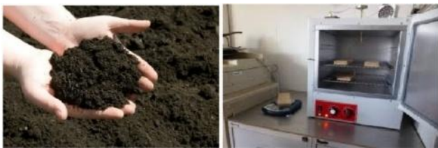
Figures 2: Soil sample

The soil that is being discussed in the present study was collected from an area called Humma, located in the Sambalpur district of the state of Odisha, India. The stored soil sample is identified from the reservoir bed and is attributed to high plasticity clay soil (CH) having considerable amounts of silt. The detailed properties of soil can be found in Chapter 4, Table 4.1. Thereafter, the soil is prepared for laboratory tests. The ground soil was then air-dried or oven-dried. The clods were broken by a wooden mallet and pulverised. The sieving was done through a 4.75 mm sieve, after which tests were carried out. The site of the collected soil sample and the oven-dried soil sample are shown in Figure 2.