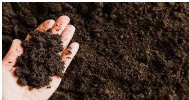
Figure 1: Improvement of a soil property of the existing soil.

Swelling clay, heave soil, and expansive soil can be called by many names. It is the soil that undergoes much volume change when it changes in moisture content. Where the breakdown of the igneous rocks occurs in extreme weather conditions seasonally, under expansive soils. In India, these soils usually develop due to weathering action on basalt rocks. Other than basaltic rocks, deposits have been obtained from many other types, such as extremely old sedimentary deposits. These minerals found in the clay fraction are montmorillonite and a mixture of montmorillonite and illite.